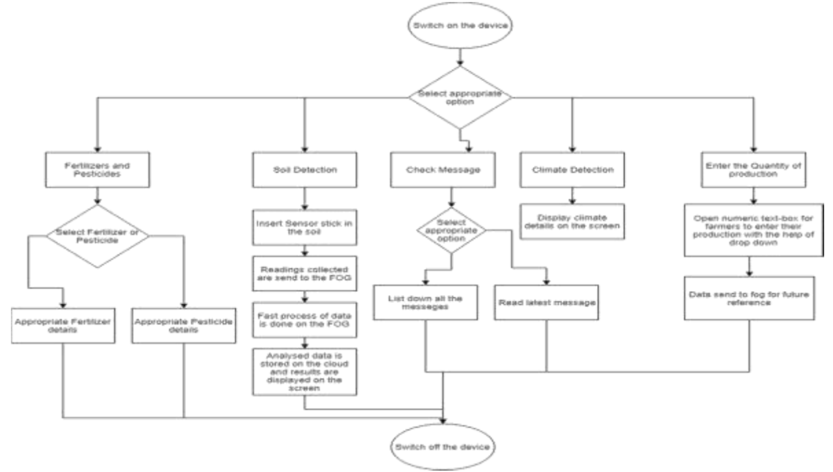
Fig. 3 Block Diagram

SMS (Text based service) – As we discussed about the reach of mobile networks and internet access, not all places will have the reach of network so getting the reports e.g. (live weather updates) will be difficult for such conditions. We are providing text based service once a day. Where we will send message on each device for the day's weather forecast for morning, noon and evening.