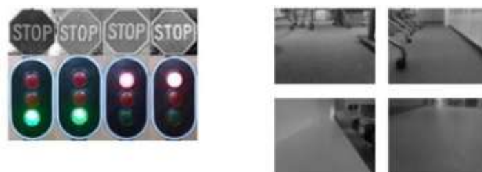
Fig 4.1: - Positive and negative samples. [3]

Open CV provides a trainer as well as detector. Positive samples (contain target object) were acquired using a cell phone, and were cropped that only desired object is visible. Negative samples (without target object), on the other hand, were collected randomly. In particular, traffic light positive samples contain equal number of red traffic lights and green traffic light. The same negative sample dataset was used for both stop sign and traffic light training. Pictures below show some positive and negative samples used in this project.