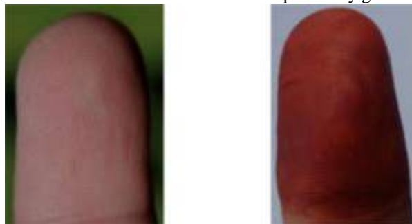
Fig. 1 a) A wrinkled fingerprint

Due to distinguishing physiological and behavioral traits, fingerprints are considered most reliable biometric identification system. Highly precise and advanced commercial fingerprint recognition systems are available in market. Fingerprint recognition is well researched problem. But these systems get affected by fingerprint acquisition, skin distortion, moisture or dark mehandi drawn on palm. If a dark mehandi is drawn on palm, scanners are not able to capture an image. So it becomes essential to use multispectral fingerprint scanners during fingerprint acquisition. Fingers get wrinkled or shriveled, when dipped in water for a long period. Wrinkled fingerprints or mehandi on fingerprints cause non-isometric deformation. It means the distance between minutiae and core point may get varied.