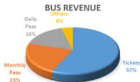
Fig 1 Bus Revenue

From the deep literature survey, we have understood that ticketing and issuing passes through digital or smart cards is not a new concept. Countries like Europe, Russia, Hong Kong, United States, Canada etc. have already implemented this model. Depending on the mode and vehicle of transportation, these cards are used by the commuters for daily ticketing, bus passes and discounts for different section of the population (students, women, senior citizens, specially-abled etc.). Commuters need to carry these cards with themselves for using it as a pass in order to avail a public transport service. Minor problem with this existing system occurs when commuters, at times, forget to carry their passes with them or gets it misplaced. This issue can be eliminated by digital passes. Fig 1.0 shows the bus revenue generation statistics[36].