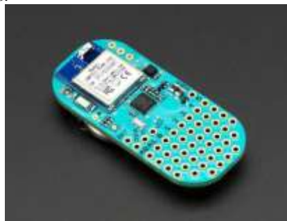
Fig. Light Blue Bean Arduino

Light Blue Bean: Light Blue Bean is an Arduino- compatible microcontroller board that ships with embedded Bluetooth Low Energy (BLE), RGB LED, temperature sensor, and an accelerometer. Bean+ is the successor to the already popular, which includes a rechargeable LiPo battery along with a couple of Grove connectors. The board comes with a coin-cell battery, which further helps it to maintain the small form factor. It can be paired with Android or iOS devices for remote connectivity and control. It also comes with software called Bean Loader for programming from Windows or Mac equipped with BLE. Bean Loader installs an Arduino IDE add-on for programming the Bean platform. An Atmega328p microcontroller with 32KB Flash memory and 2KB SRAM powers light Blue Bean / Bean+. With eight GPIO pins, two analog pins, four PWM pins, and an I2C port, Bean is perfect for quickly prototyping BLE-based IOT projects.