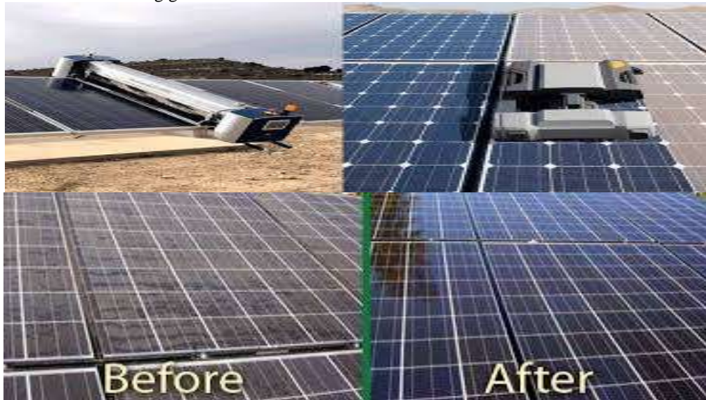
Fig-I Clean Solar panel and solar panel with dust

signals, sun oriented street studs/signals can likewise be checked through the proposed framework. In India, visit power cut is normal. Because of this issue, it is critical to utilize sustainable power source and checking it. By checking the vitality estimate, families and networks who are utilizing sun based force can use their vitality creation and utilization during great climate.