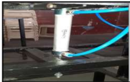
Fig A: - double acting cylinder.

In this pneumatic system, it is the concept of transmitting or work done using compressed air. It was similar to the hydraulic system. The pneumatic time delay hammering machine consists of cylinders these are DAC mean double- acting cylinder it is used to the force of air to be move-in both sides extend and retract strokes. From the double-acting cylinder. They have two-port to allow the air in one for outstroke and one is the in stroke. Then the stroke length for this design is not limited however the piston rod is more remuneration to buckle and bend.