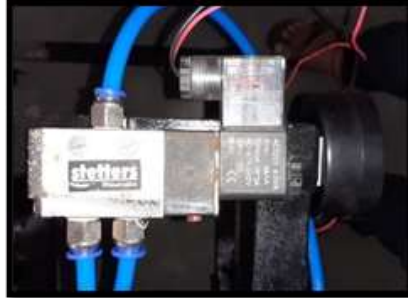
Fig C: - 3/2 Solenoid D.C. Valve

In this project we used 3/2 solenoid operated direction control valve and it works or operate on 230 volt A.C. supply. In this project the solenoid valve is useful for convert the electric signals into movement of actuator. The solenoid it is applying on an electricity to the solenoid quickly directs air through the valve is consist of an on/off bulb. Then the works on the air supply is connected on a solenoid valve is a supply passing through the double acting cylinder. The quickly response time and high flow rate of a time delay circuit makes our pneumatic solenoid valve suitable for numerous application.