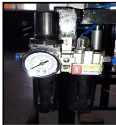
Fig B: - FRL unit

The FRL unit is working on a like pressure regulator, which is the lubricator function of an FRL unit. The lubrication oil is more effectively working to help with pneumatic components. Which the filter regulator lubricator unit is of is a filtered and remove the unwanted impurities and next passing through the fresh air on a next component. The FRL is the most important part of a pneumatic operating structure or any pneumatic projects.