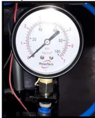
Fig D: - Pressure gauge

Pressure gauge is a device which is measuring device. Then the measures the pressure in a pneumatic supply on air. The pressure gauge are widely used on all over the world in industrial environment because our used in a small structure, practical and project on a pneumatic circuit measured the pressure in air the air is supply from compressor which is flow the compressed air is passing through the tubes because the pressure gauge. The pressure gauge the works from the pressure measurement.