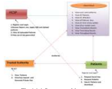
Fig 4.1.1 System architecture