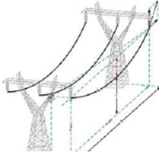
Figure 1. transmission line

functionalities which makes it a bit more efficient than the previous existing system such as it has real time monitoring of transmission line for any fault .[7] It also has the capability to inform the nearest power centre. Different approaches could be adopted for dealing with the transmission line failure .