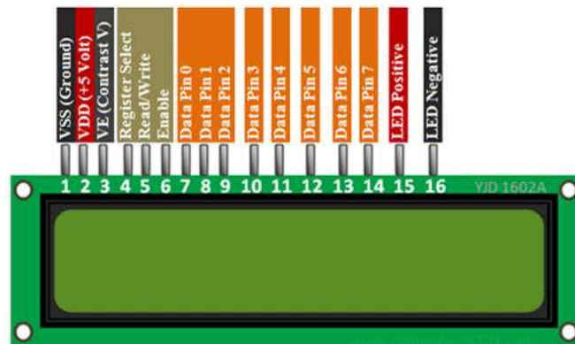
Fig2. Pin diagram