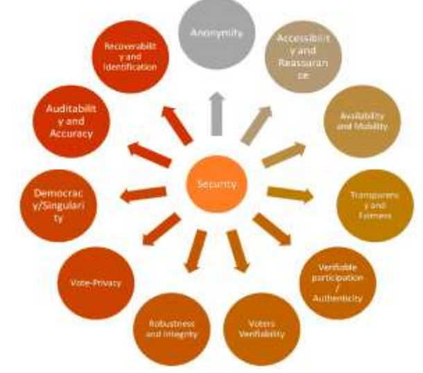
Figure 2: Security requirements for electronic voting system.