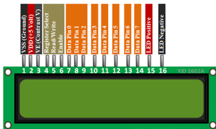
Fig2. Pin diagram