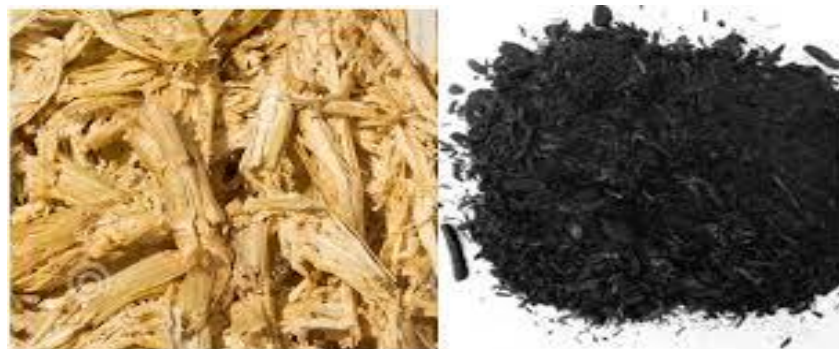
Fig 2.1. Sugarcane Bagasse Ash

SCBA is obtained from sugar industries where bagasse is used as fuel in boilers. The ash is collected from furnace and boiler units.