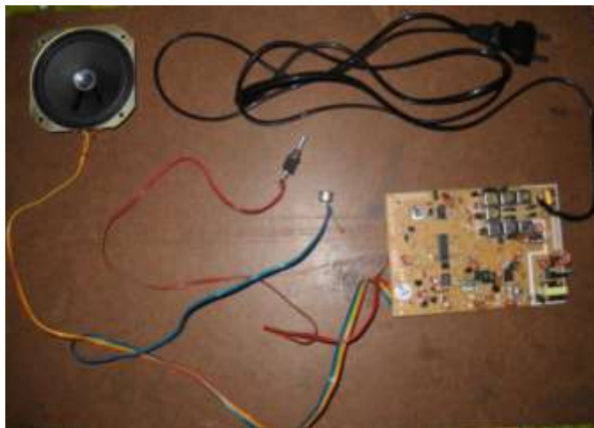
Fig 3: Voice communication transceiver Module 2

The designed Module is divided into these parts: Mains Coupling Unit, Phase Locked Loop Transceiver, Duplexer and Audio Amplifier. Mains coupling unit provides the working voltage of 9V to the module and allows voice signals to flow between two units over power-line. The Mains step down transformer with voltage rating of 0-9V is used to draw the required voltage. This stepped down 9V across secondary winding is AC in nature but circuits need DC. Hence bridge rectifier is constructed using four 1N4007 rectifier diodes and gets rectified +9V across end points.