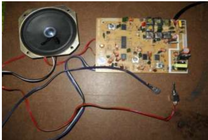
Fig 2: Voice communication transceiver