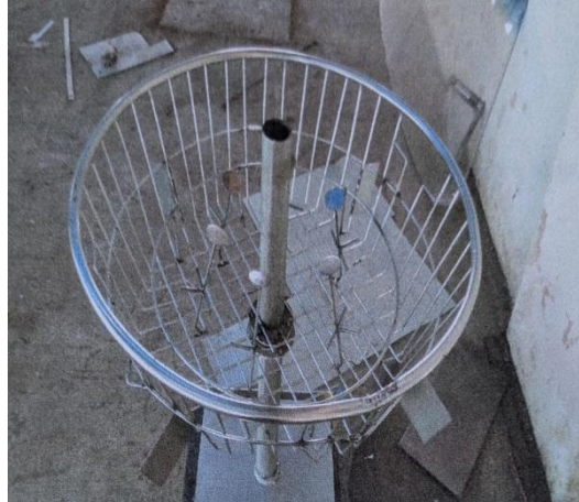
Fig -1 Dish holder