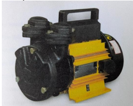
Fig -3 Electric pump

Easy maintenance and spares availability