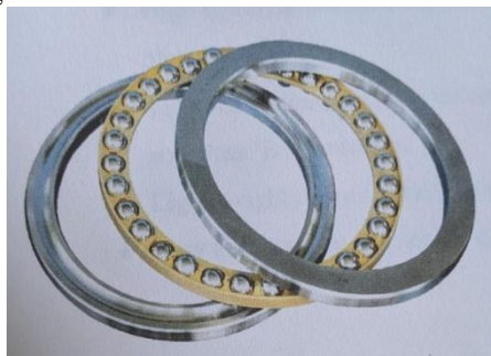
Fig -2 Bearing