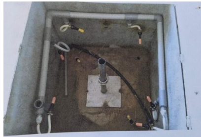
Fig -4 Plumbing system