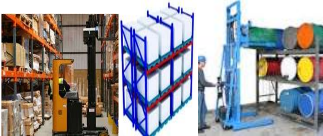
Figure 4: Types of storage material handling systems

Equipment used for holding, transferring or storing materials over a period of time. Some storage equipment may include the transport of materials, see Figure 4.